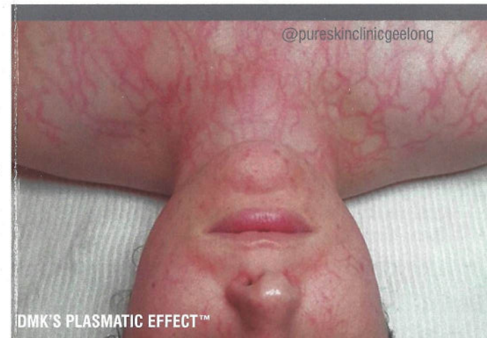
DMK'S PLASMATIC EFFECT™

Schedule your consultation today dannemking.com